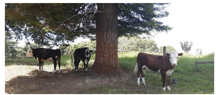
The Cattle are lowing... planning their next escape...

We ended our year with our community retreat, once again held electronically. We appreciated the inspiring