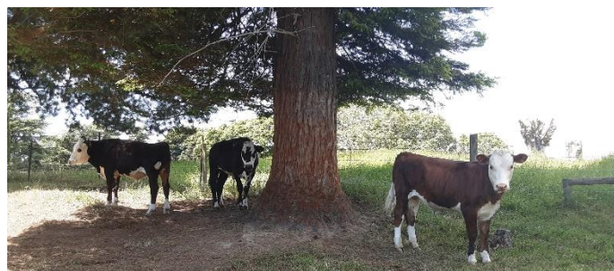
The Cattle are lowing... planning their next escape...

Michael took off up the cattle ramp and flew over the end. Within hours he had twice jumped fences and escaped into forbidden pastures. We thought things had improved after that first day, but early November had Michael and Gabriel escaping again, this time into the monastery grounds. Fortunately, they didn't get into the vegetable garden or orchard. We hope they will improve with age.